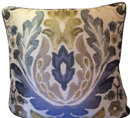
Pillow Cezanne cm 60 x 60

CENTRO TENDAGGI ARREDAMENTO Italian Textile