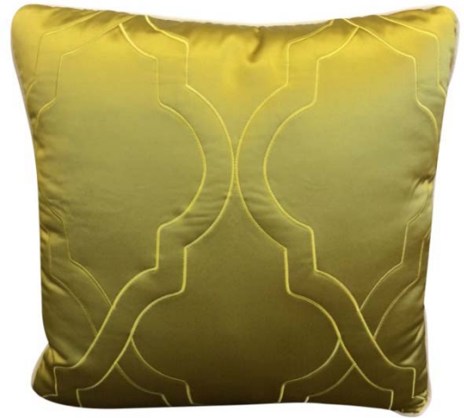
Pillow Gauguin col. 6 cm 40 x 40