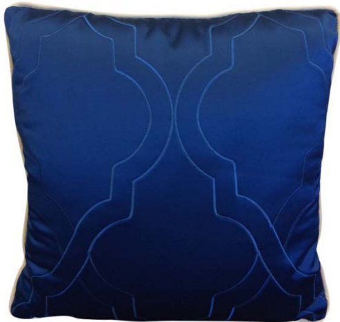
Pillow Gauguin col. 8 cm 40 x 40