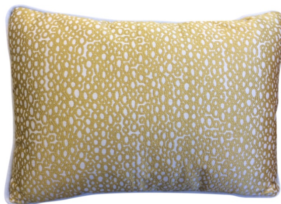
Pillow Derain col. 1 cm 30 x 40