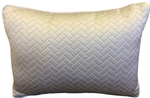
Pillow Munch col. 2 cm 30 x 40