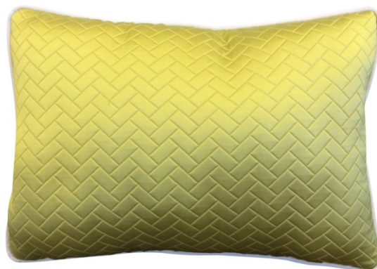
Pillow Munch col. 6 cm 30 x 40