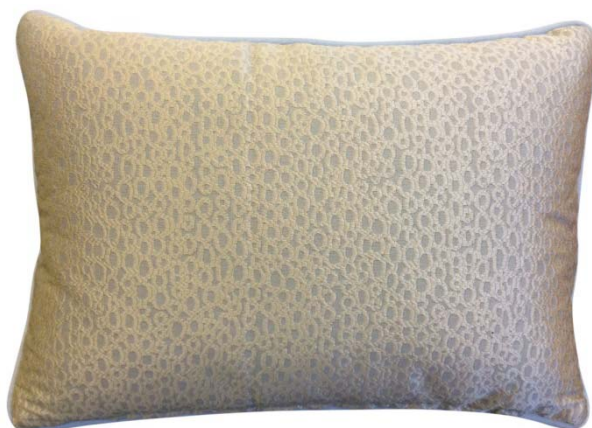
Pillow Derain col. 4 cm 30 x 40