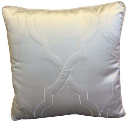
Pillow Gauguin col. 1 cm 40 x 40

CENTRO TENDAGGI ARREDAMENTO Italian Textile