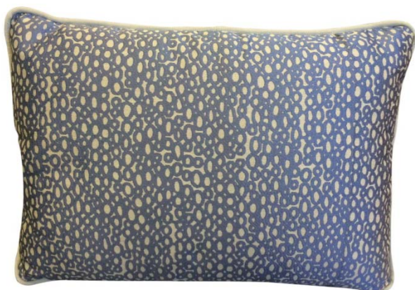
Pillow Derain col. 3 cm 30 x 40