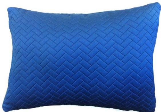
Pillow Munch col. 8 cm 30 x 40

CENTRO TENDAGGI ARREDAMENTO Italian Textile