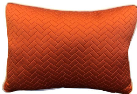
Pillow Munch col. 4 cm 30 x 40